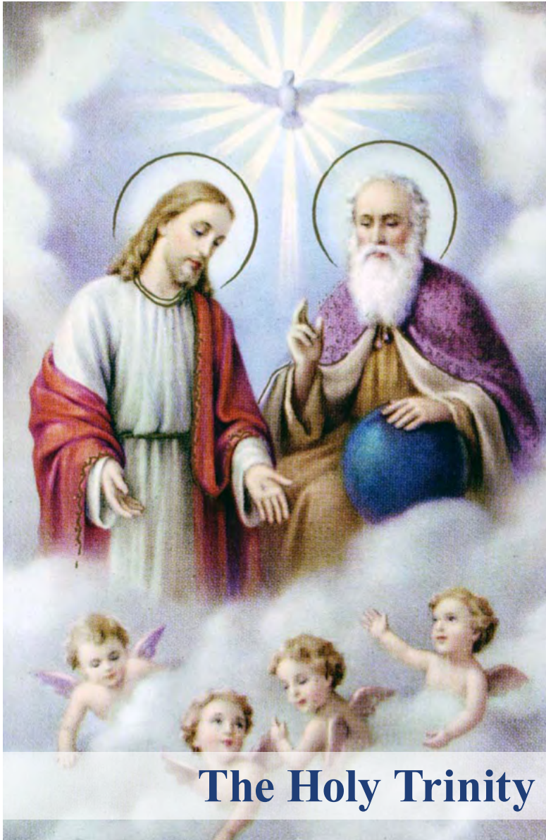
The Holy Trinity